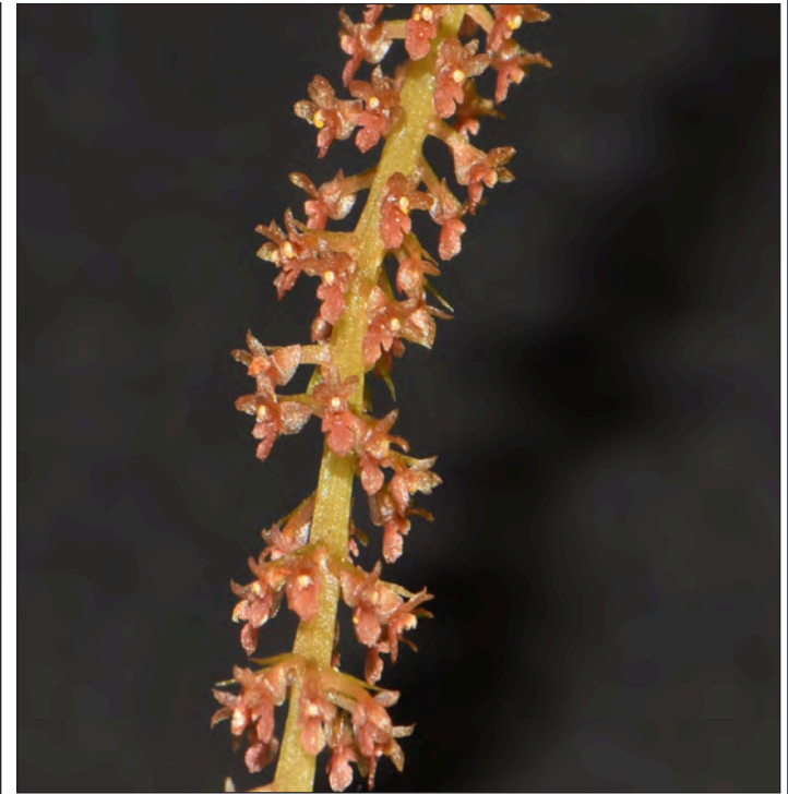
Oberonia sp.