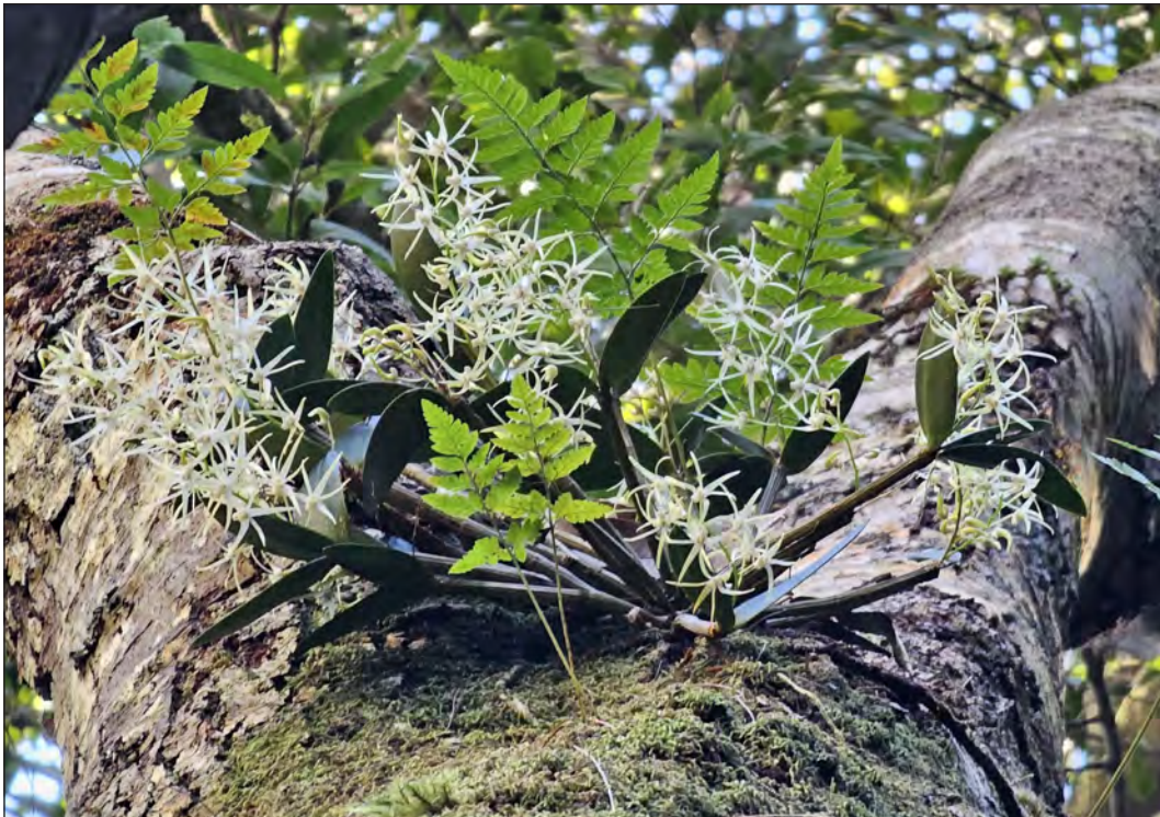
Dendrobium deuteroburneum (Rainforest form of aemulum)