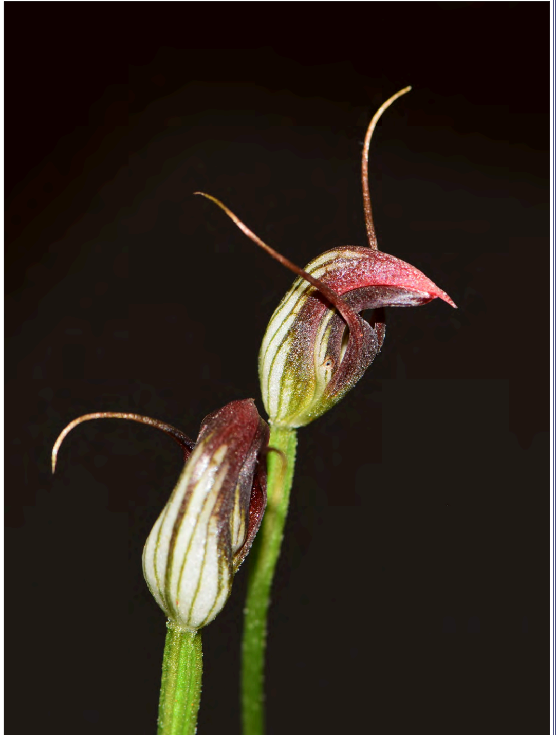
Pterostylis pedunculata