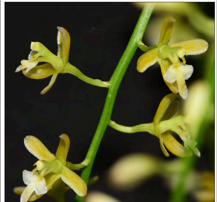
Acriopsis emarginata