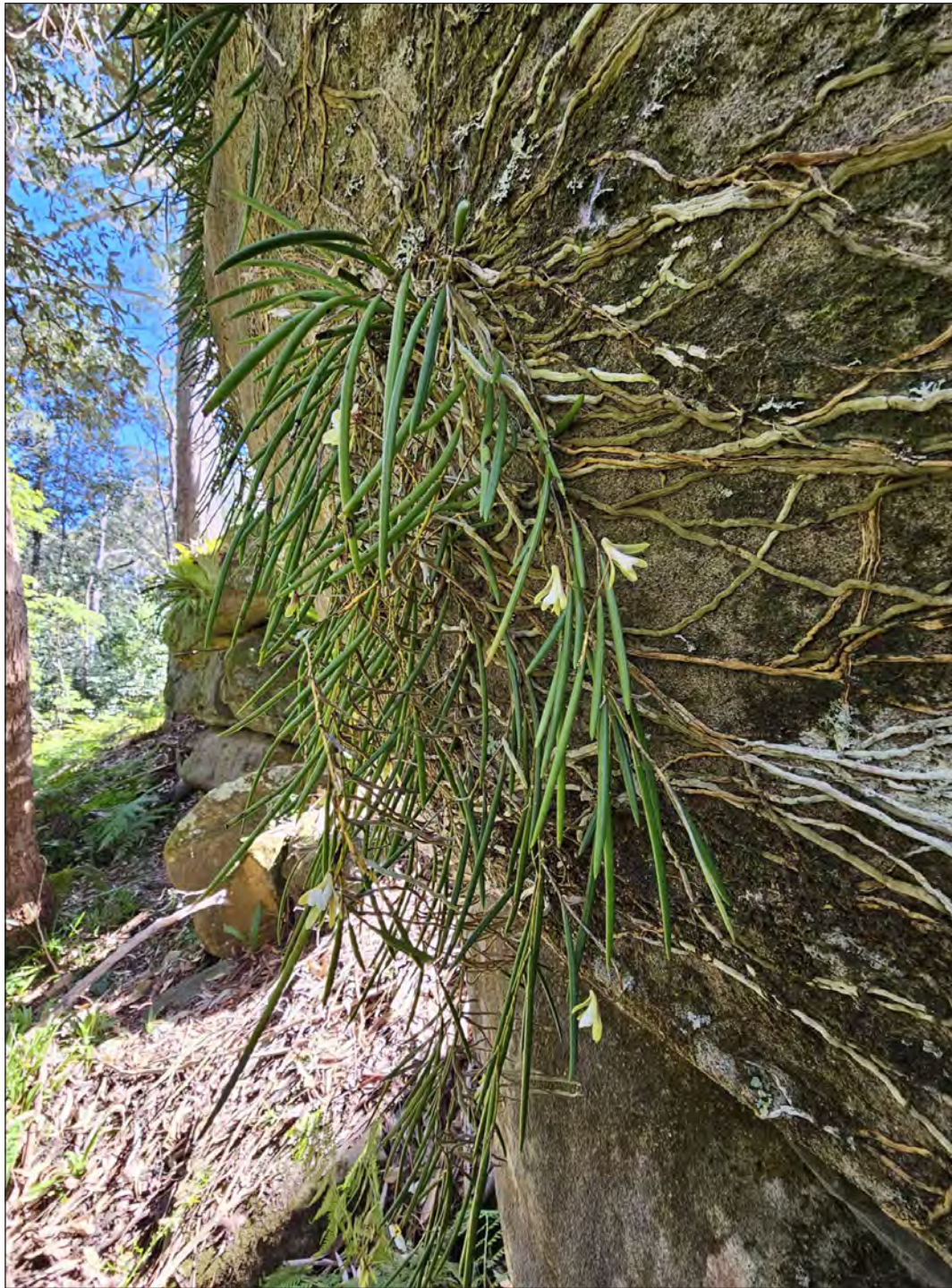
Dendrobium striolatum (Streaked Rock Orchid)