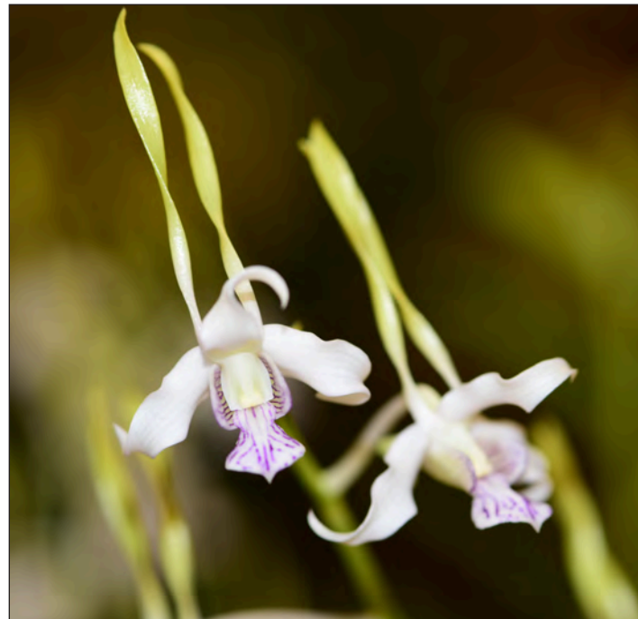
Dendrobium dalbertisii