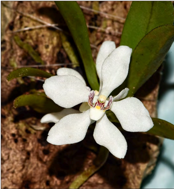
Sarcochilus falcatus Trish Peterson