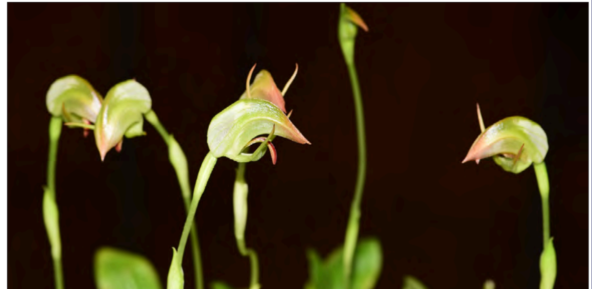
Pterostylis Nodding Grace