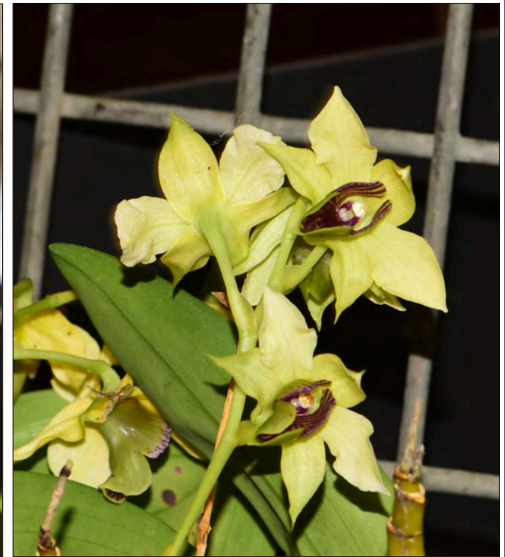
Dendrobium atrovioleaceum Li Shan