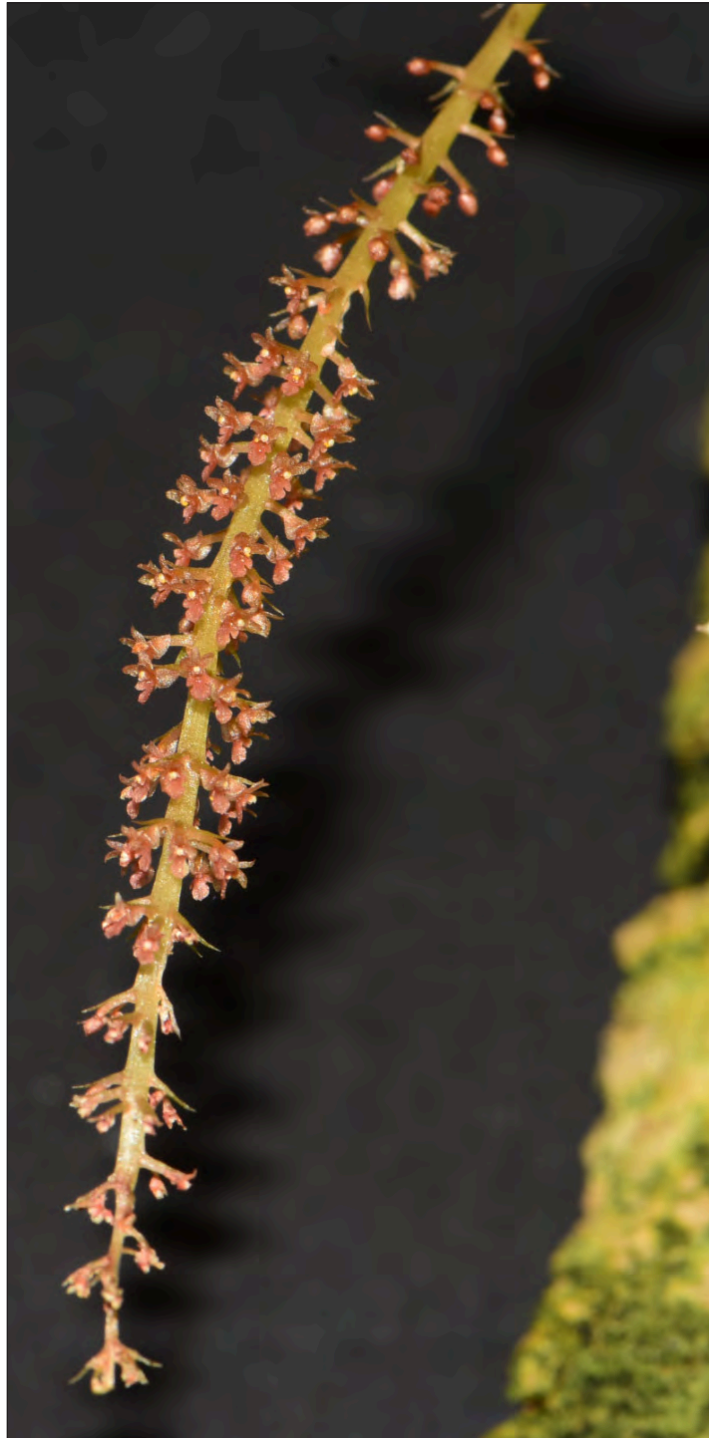
Oberonia sp.