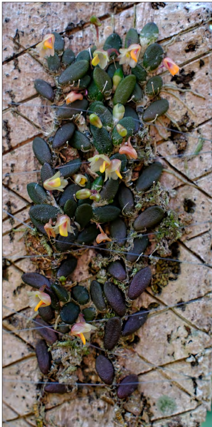
Dockrillia lichenastrum