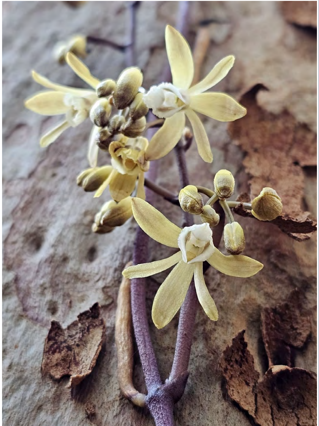
Erythrorchis cassythoides (Black Boot Lace Orchid)