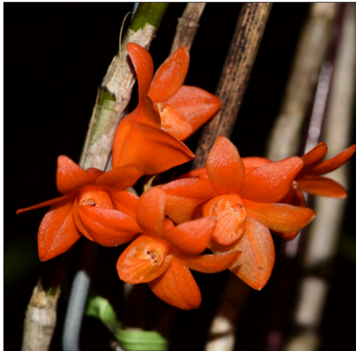
Den. Gowan's Tangelo Li Shan