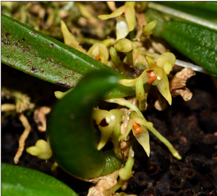
Bulbophyllum shepherdii Trish Peterson