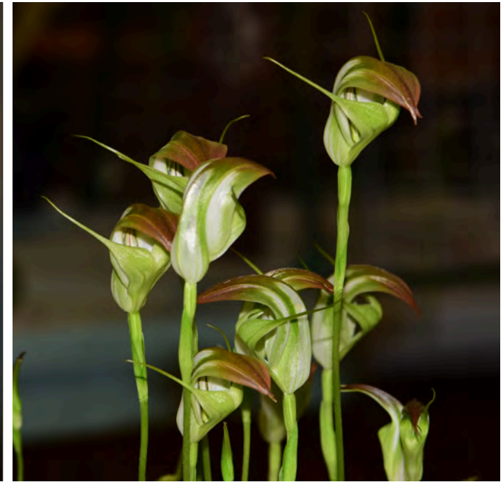
Pterostylis baptistii R.G. Blaxland