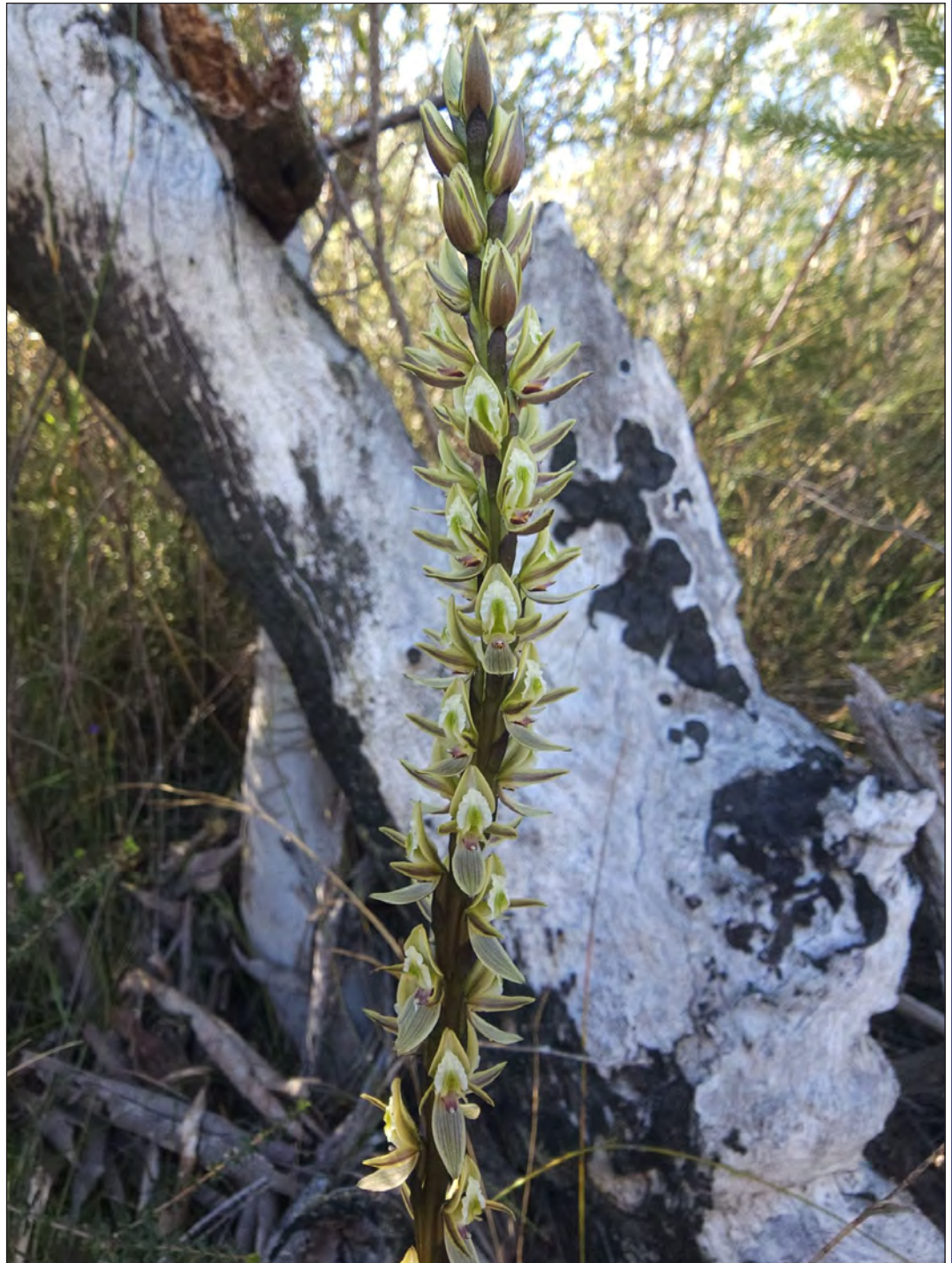
Prasophyllum elatum (Tall Leek Orchid)