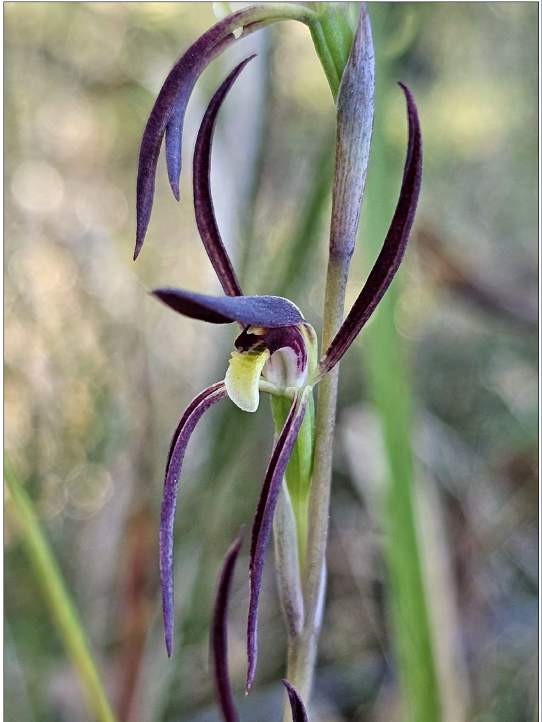
Lyperanthus suaveolens (Brown Beaks)