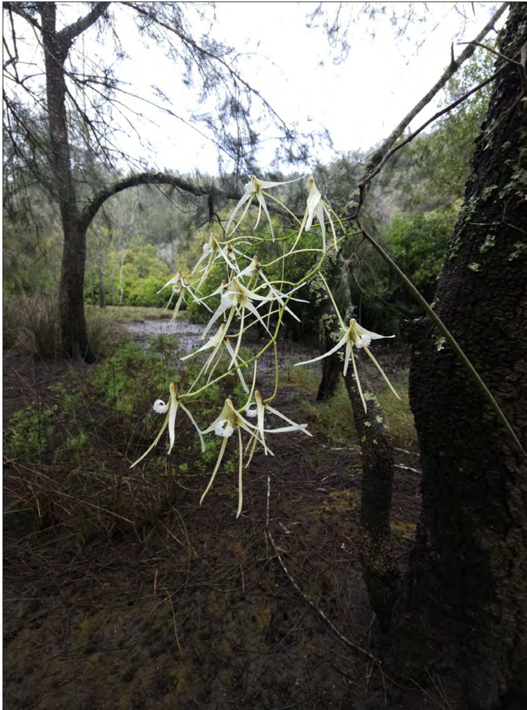
Dendrobium teretifolium (Bridal Veil Orchid)