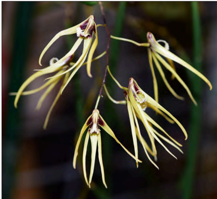
Dockrillia tetragonum