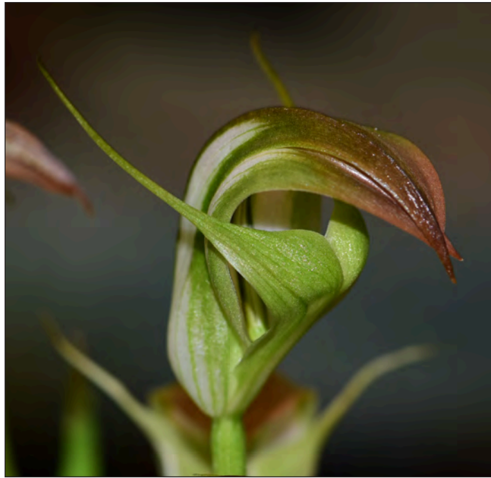
Pterostylis baptistii R.G. Blaxland