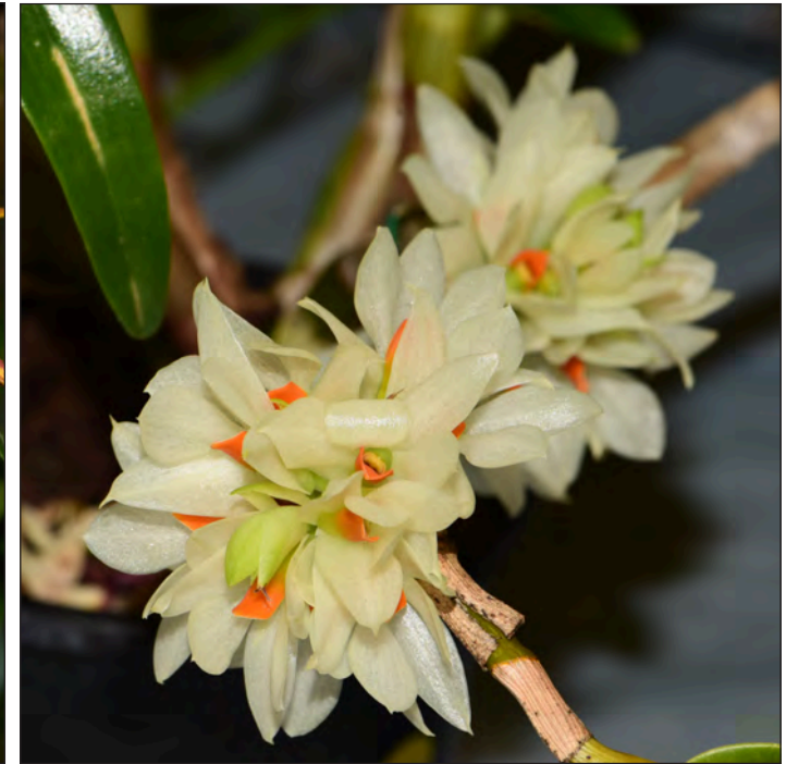
Dendrobium bracteosum Cary Polis