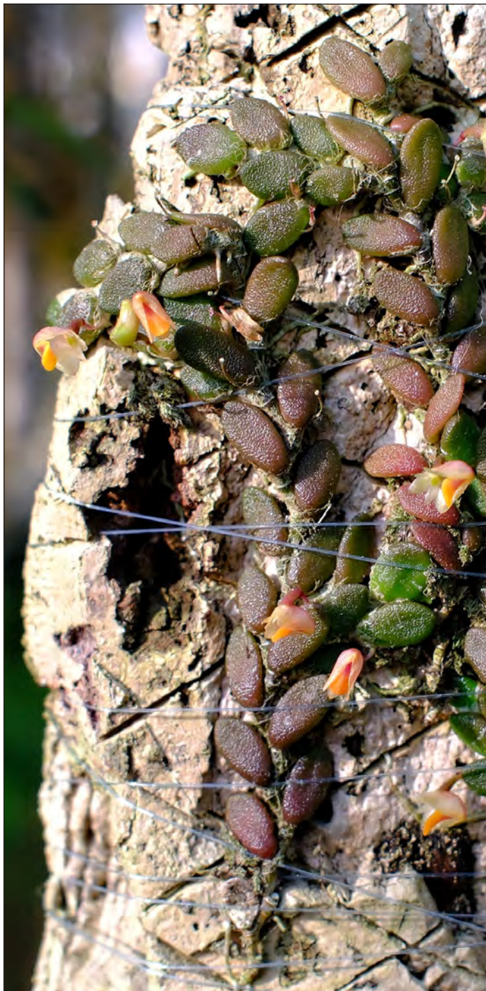
Dockrillia lichenastrum