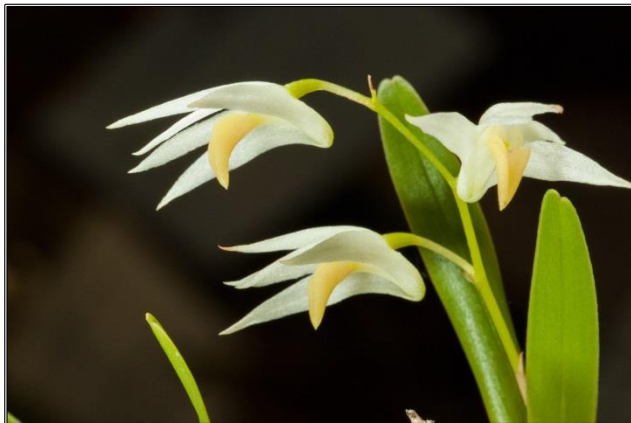
Dendrobium carrii