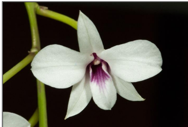
Dendrobium affine