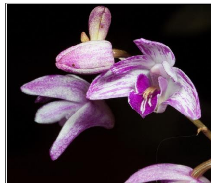
Den. kingianum 'Gotcha' - L & B Dobson