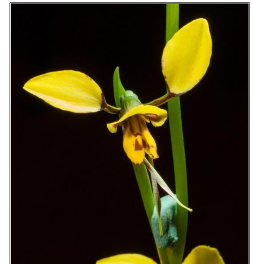
Diuris sulphurea