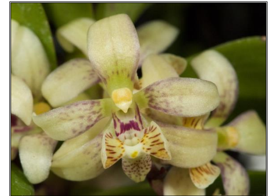
Plectochilus Kilgra – Trish Peterson