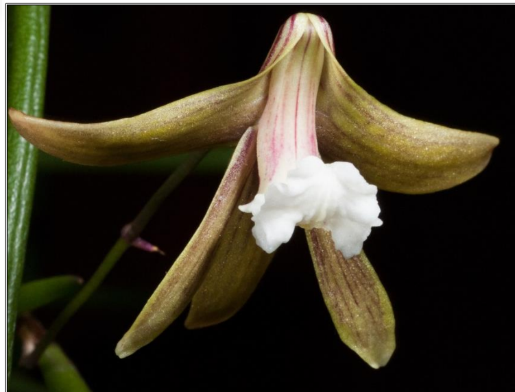
Dockrillia striolata (alba x Ruffles – Ela Kielich