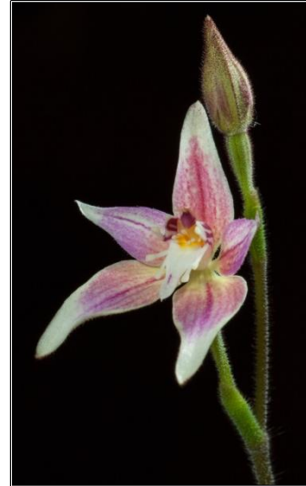
Caladenia Harlequin