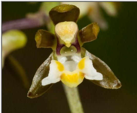
Plectorrhiza tridentata – L & B Dobson