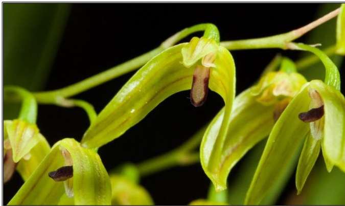
Bulbophyllum elisae