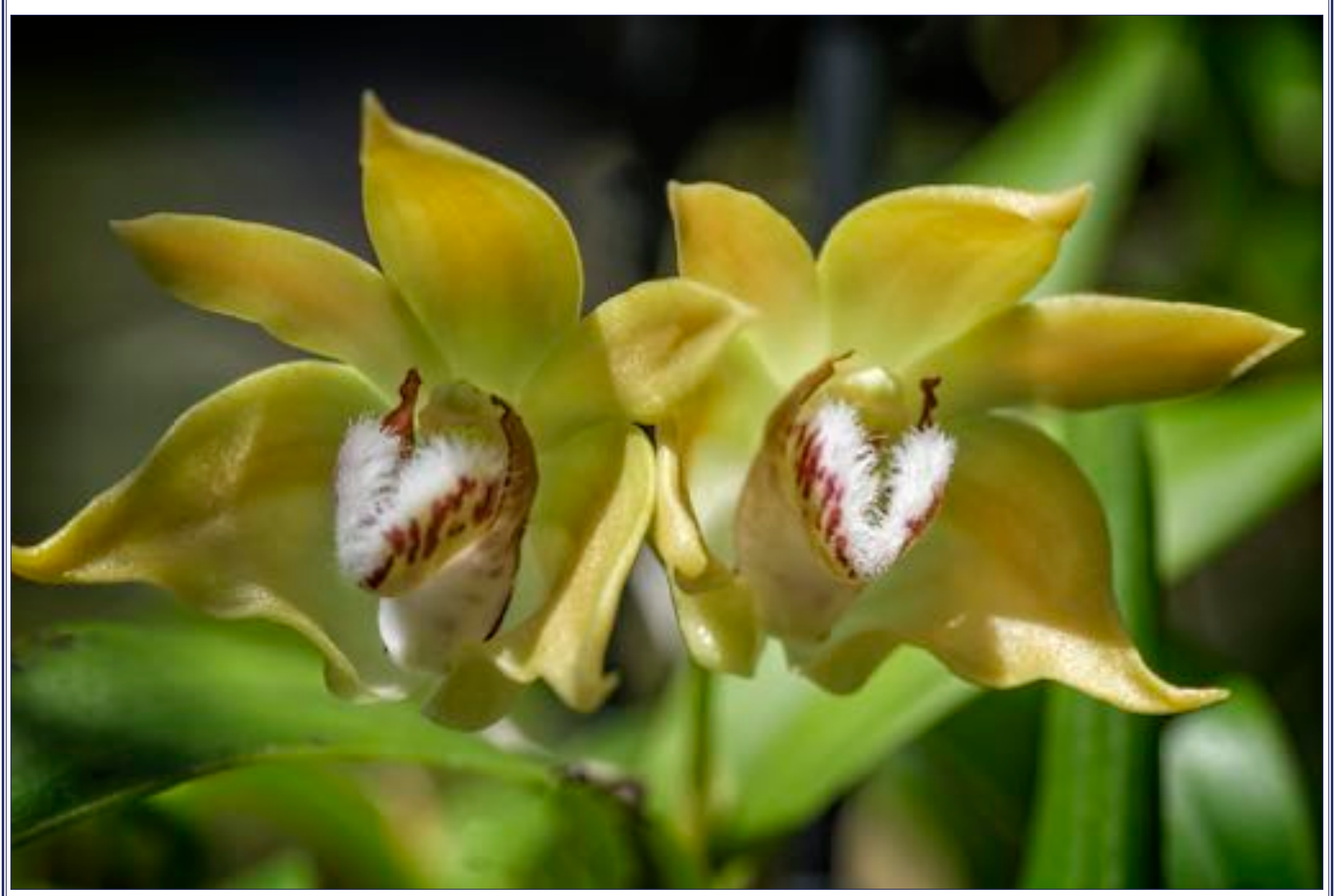
Dendrobium fleckeri L & B Dobson