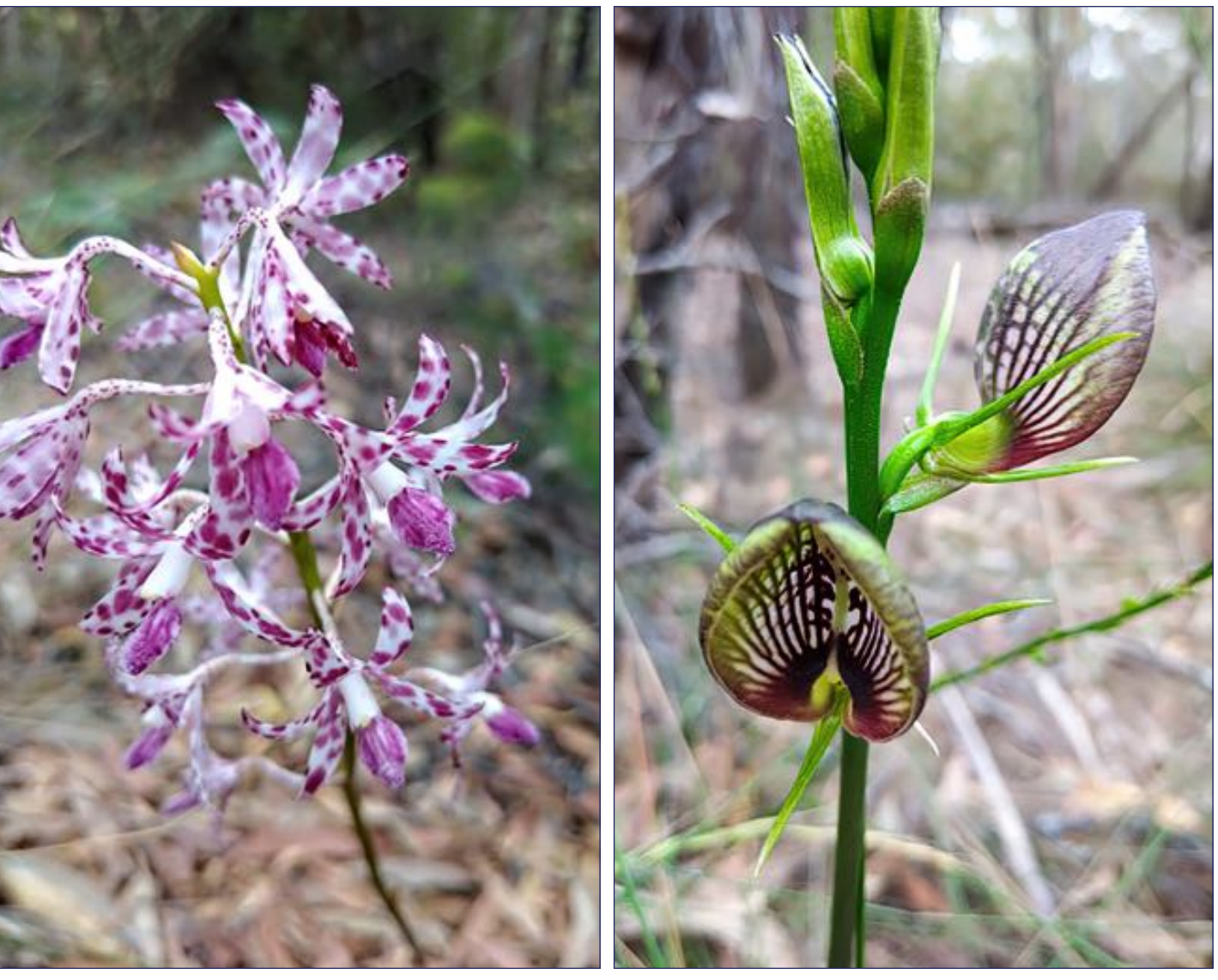
Dipodium variegatum Richard Blaxland

A beautiful species that sadly only lasts a day.