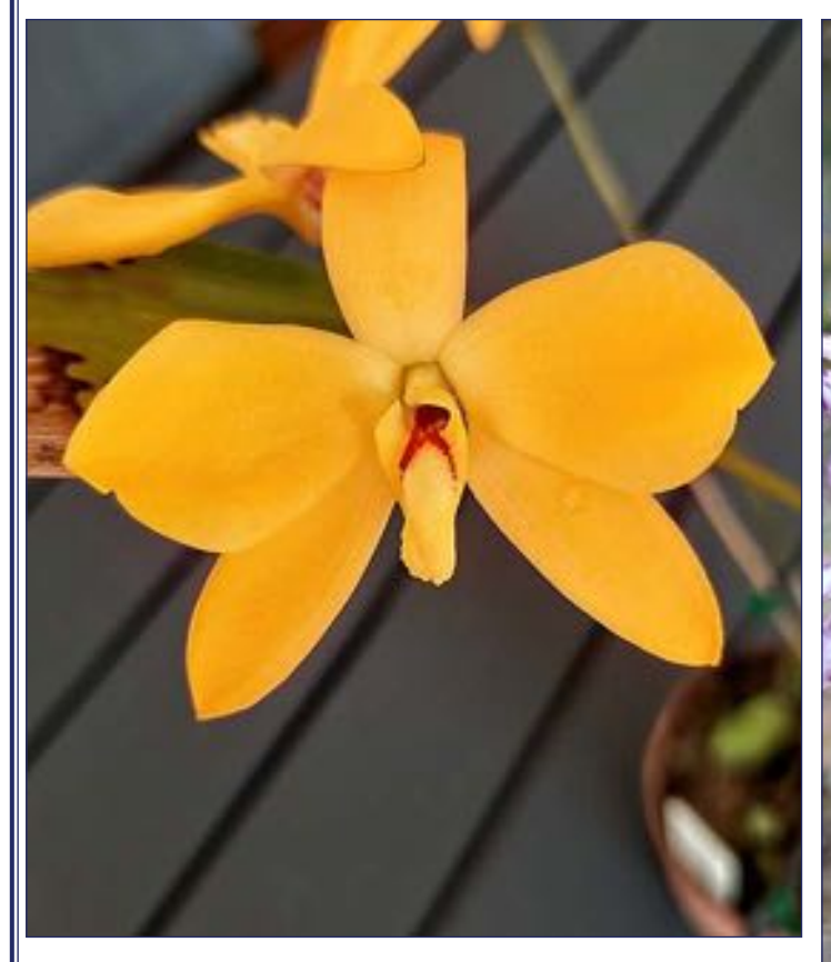
Diplocaulobium auricolor Guy Cantor

Diplocaulobium auricolor belongs to a trio of very showy species, all characterised by the broad petals, but each quite distinct in the shape of the lip. The other members are Diplocaulobium regale and Diplocaulobium centrale.