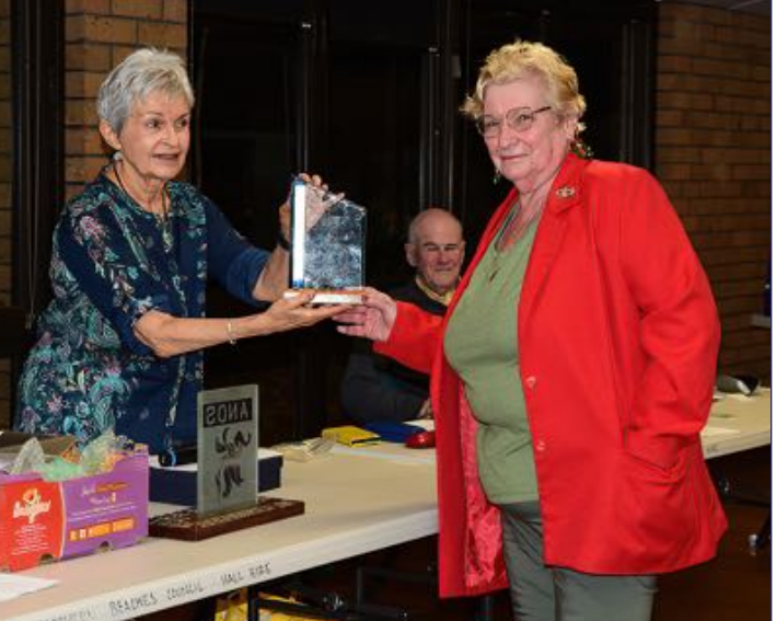
Clover being presented with the Iris Pendle for Best Sarcochilus from our October members Sarcochilus Show.