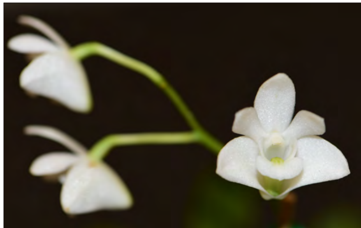
Den. kingianum 'Snow Stopper' x 'Babylon Snow' Ela Kielich