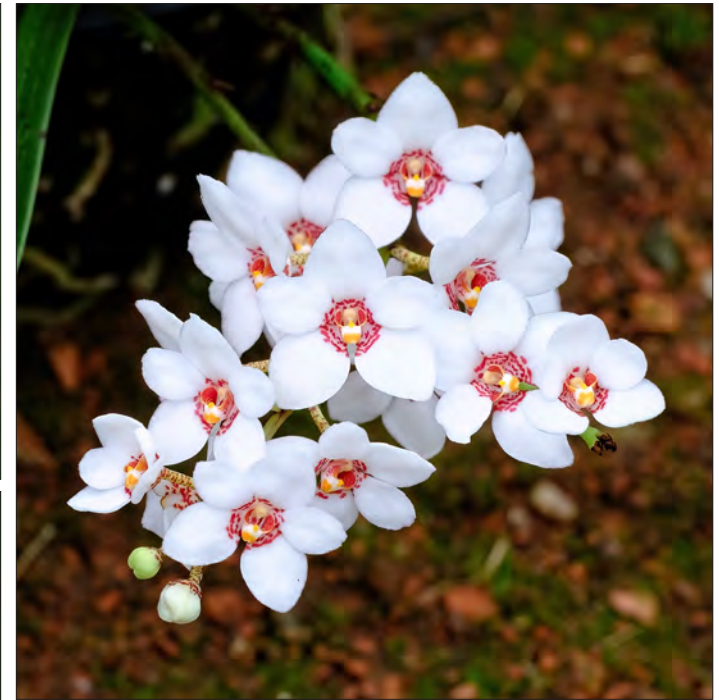
Sarcochilus hartmannii