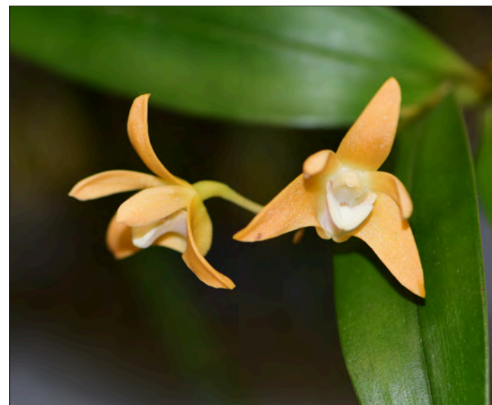
Dendrobium adae