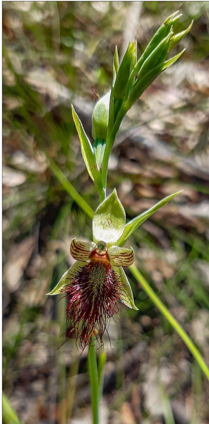
Calochilus robertsonii