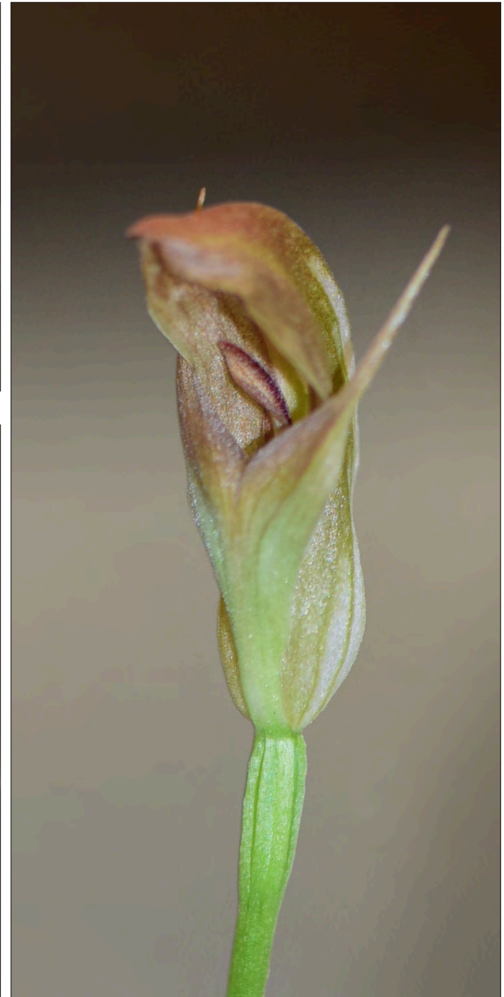
Pterostylis curta