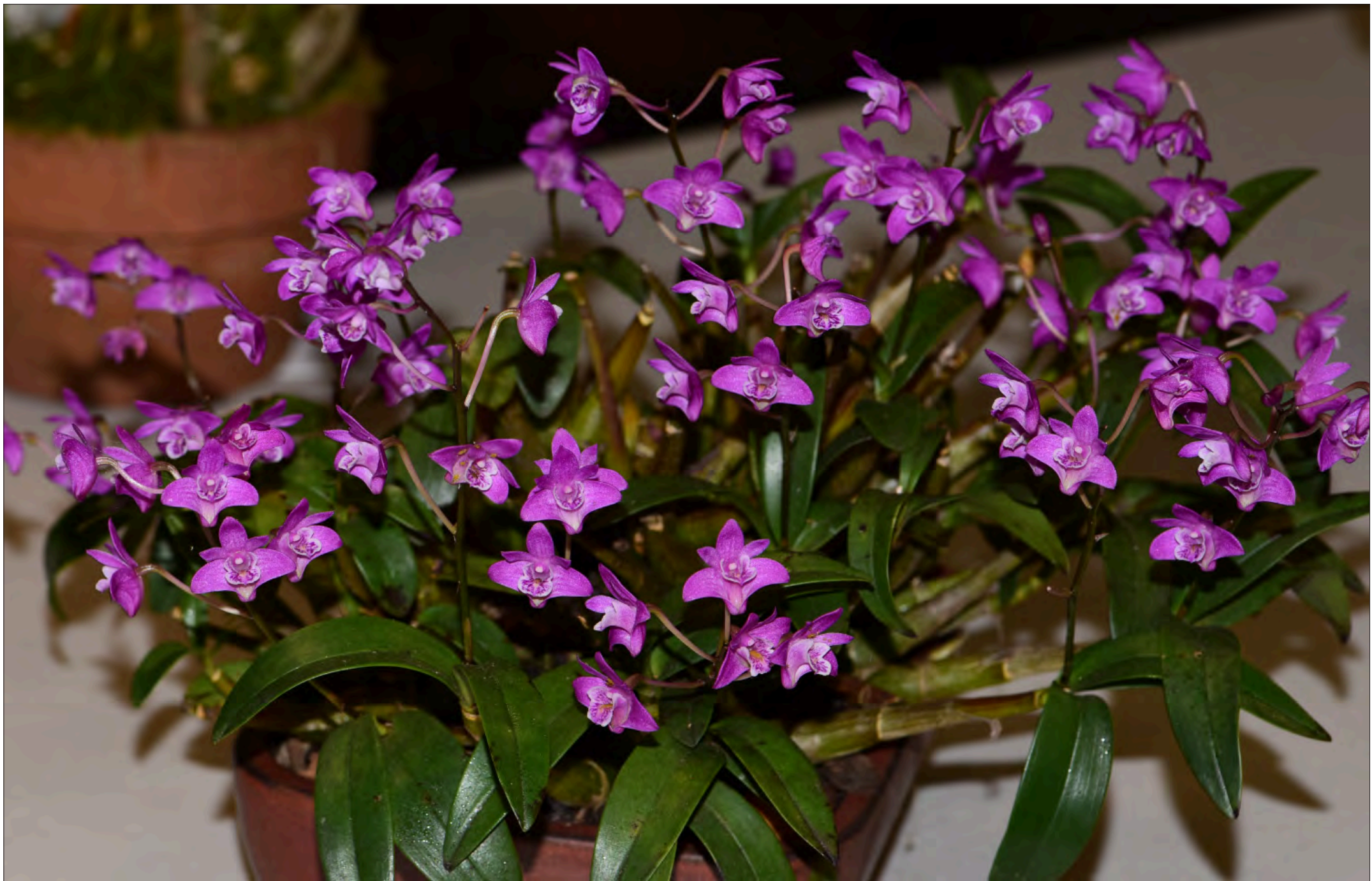
Dendrobium kingianum 'Inferno' Ela Kielich