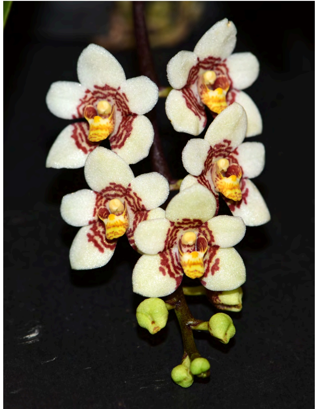
Sarcochilus hartmannii hybrid Li Shan