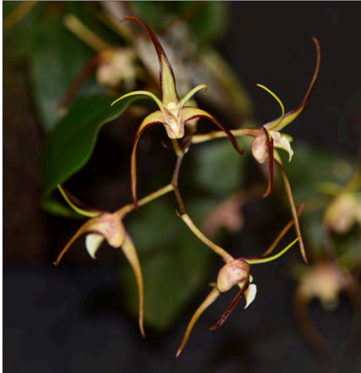
Dendrobium tetragonum