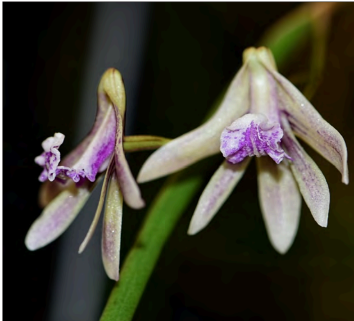
Doc.Spots x Grumpy Trish Peterson