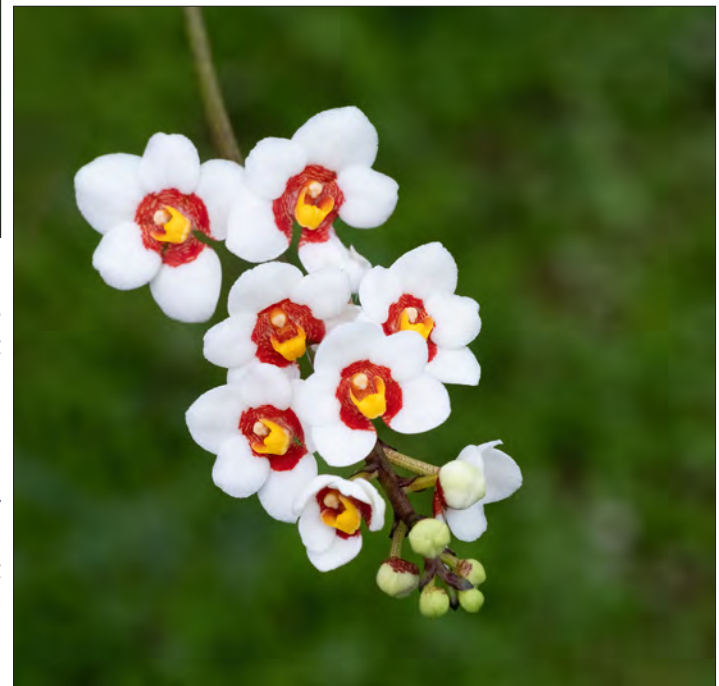
Sarcochilus Fitzhart 'Rusty Bucket' AM/AOC/ANOS Bill Dobson

The ravine orchid usually grows on rocks in dense rainforest or in shady gorges and ravines but sometimes also on the base of fibrous-barked trees. It is found between Maleny in south-east Queensland and the Macleay River in New South Wales.