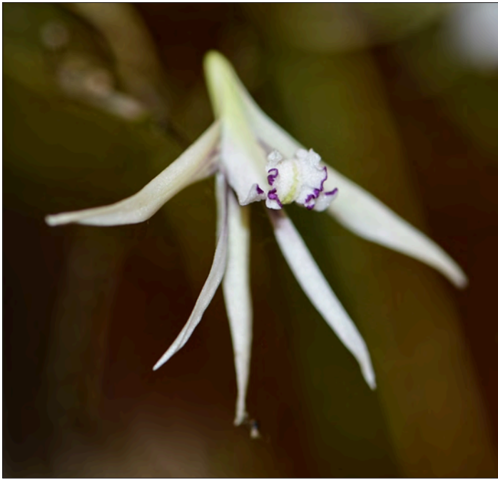
Dockrillia schoenina