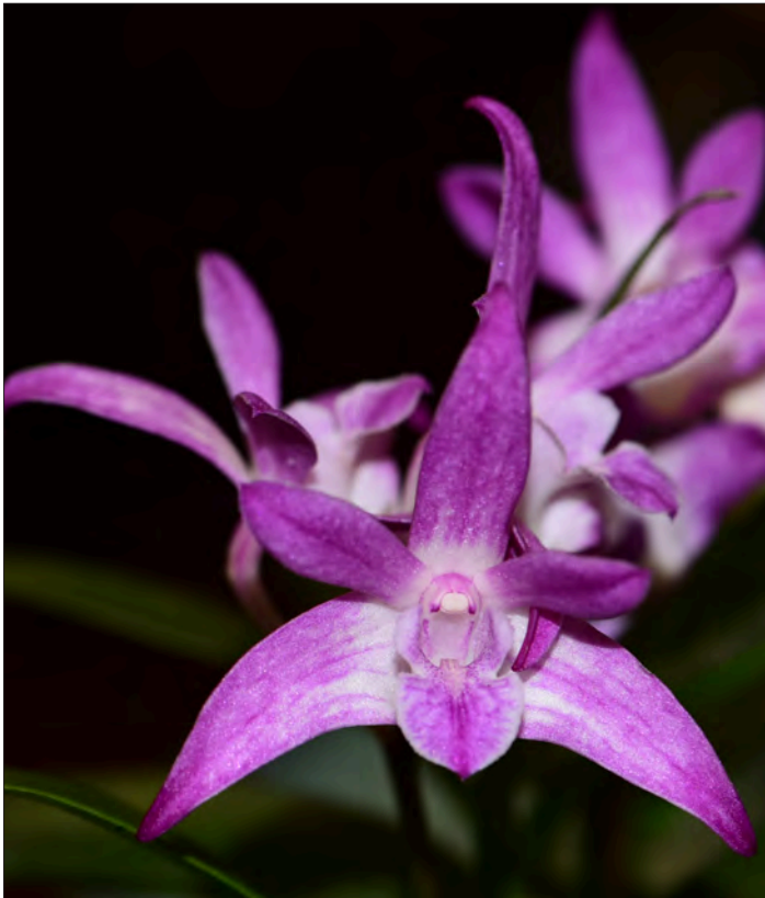
Dendrobium Brinawa Charm Ela Kielich