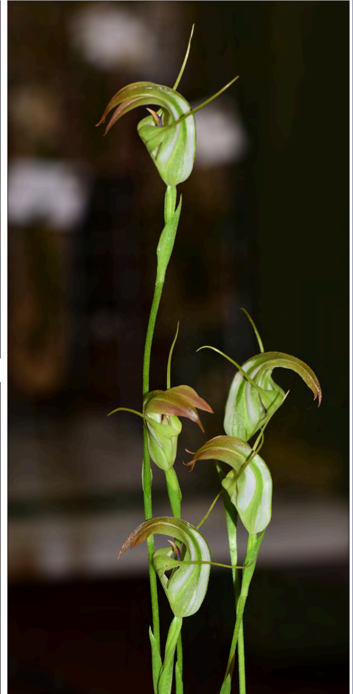
Pterostylis baptistii