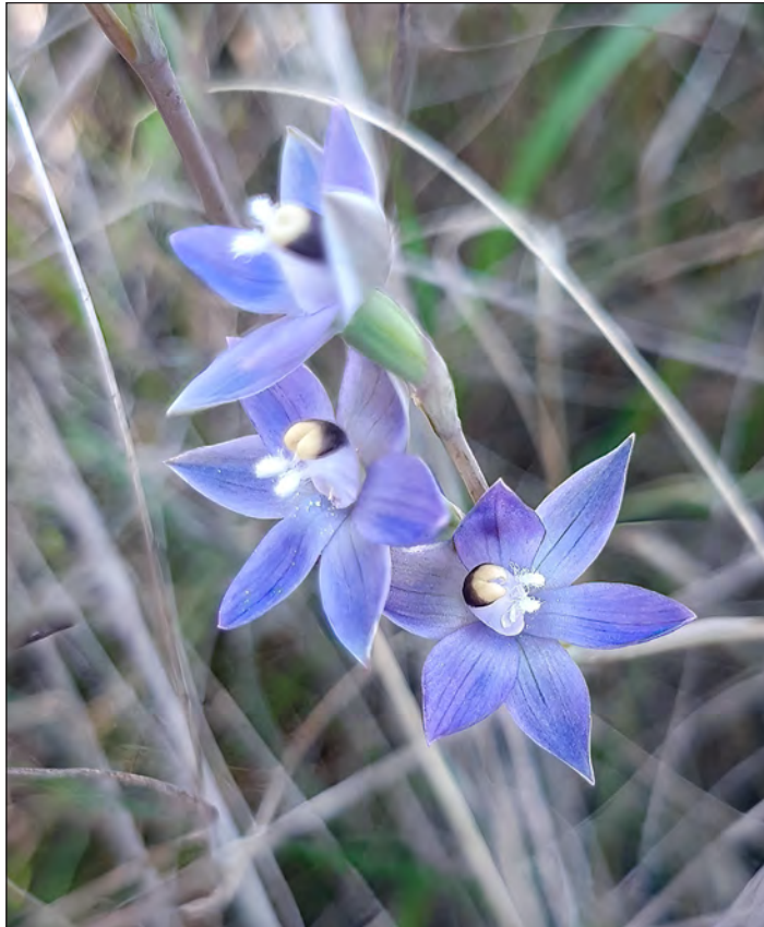
Thelymitra pauciflora