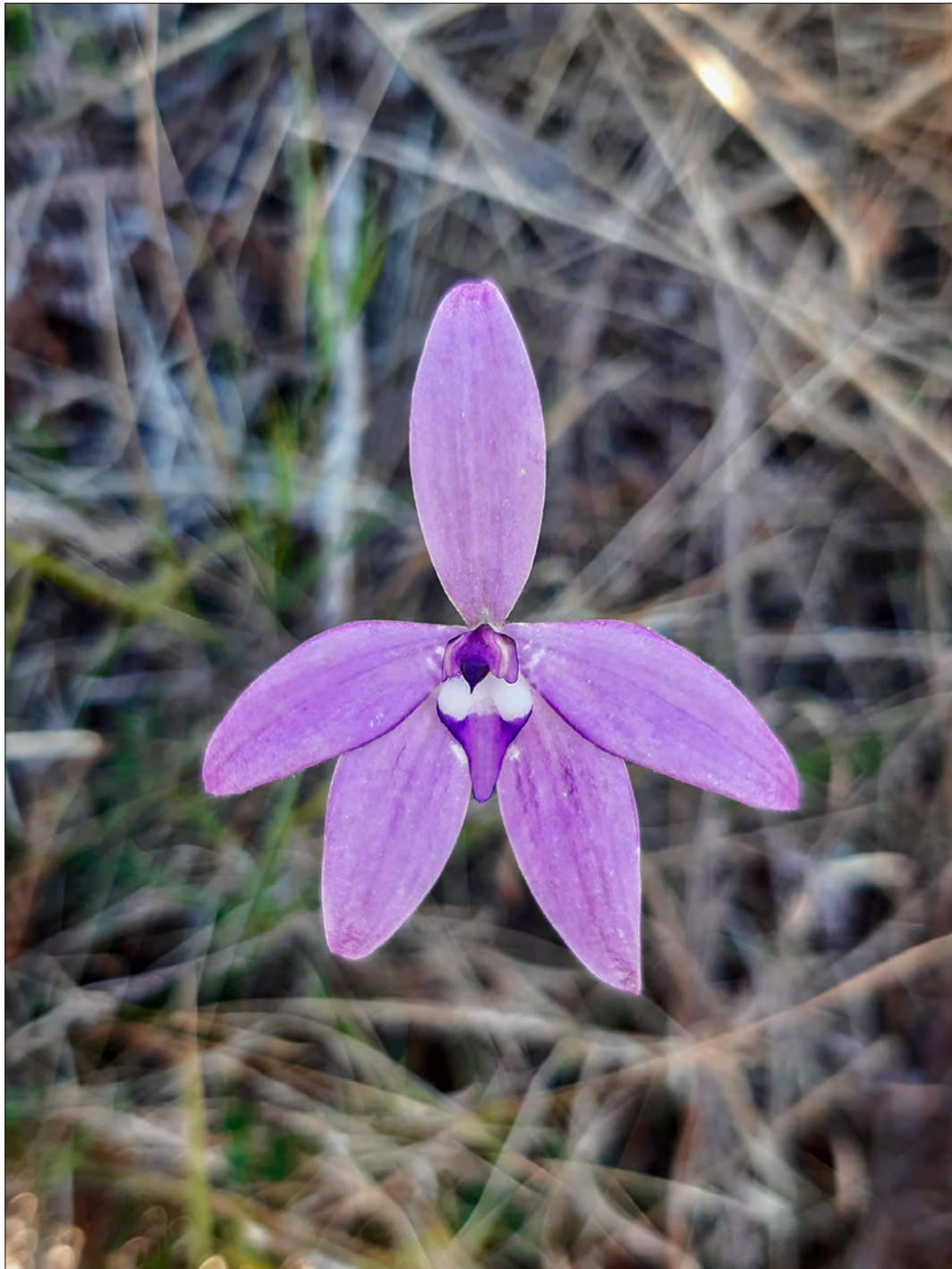
Glossodia major