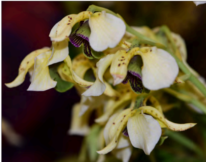
Dendrobium Happy Children Li Shan