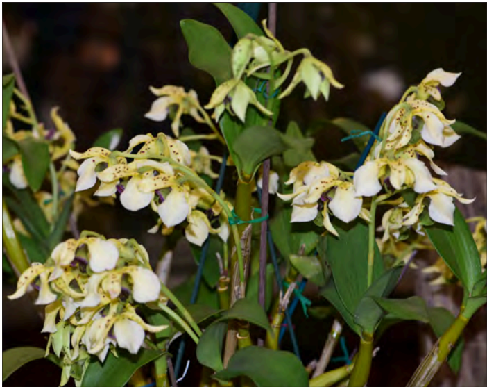
Dendrobium Happy Children Li Shan