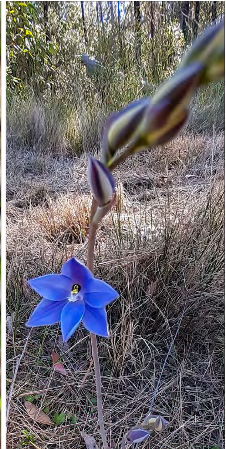
Thelymitra ixioides Trish Peterson