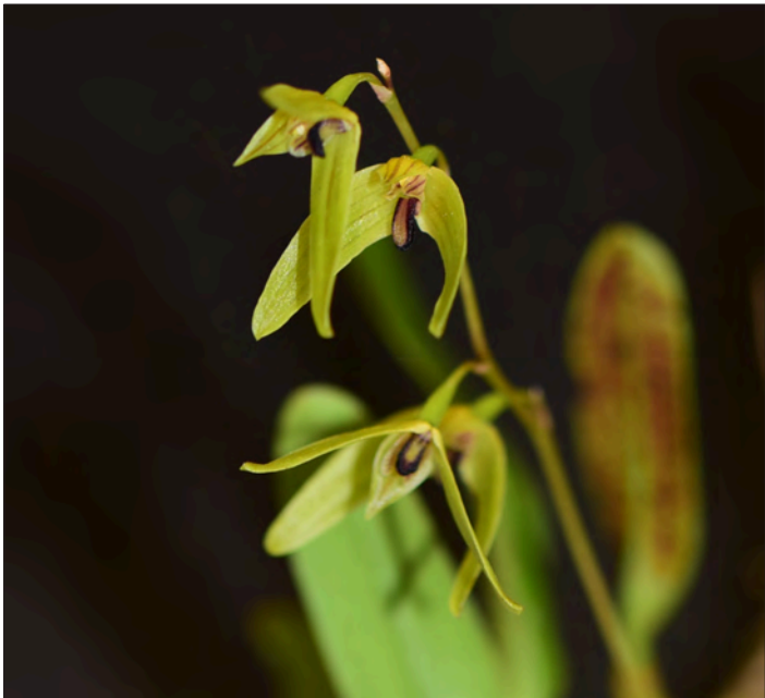
Bulbophyllum elisae