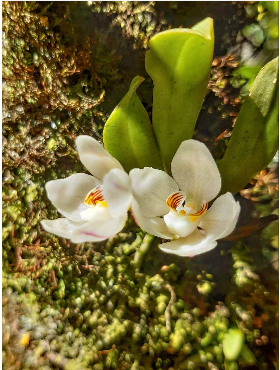
Sarcochilus falcatus Trish Peterson