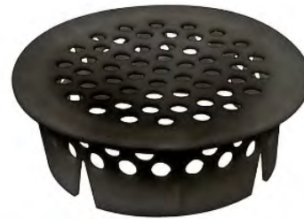
Bunnings, Jack 90mm Gutterguard plastic downpipe Cover.