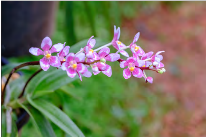
Sarcochilus fitzgeraldii Bill Dobson

Sarcochilus fitzgeraldii , commonly known as the ravine orchid , a lithophytic orchid endemic to eastern Australia. It forms large clumps with between four and eight dark green, linear leaves and up to fifteen white flowers with crimson spots near the centre.