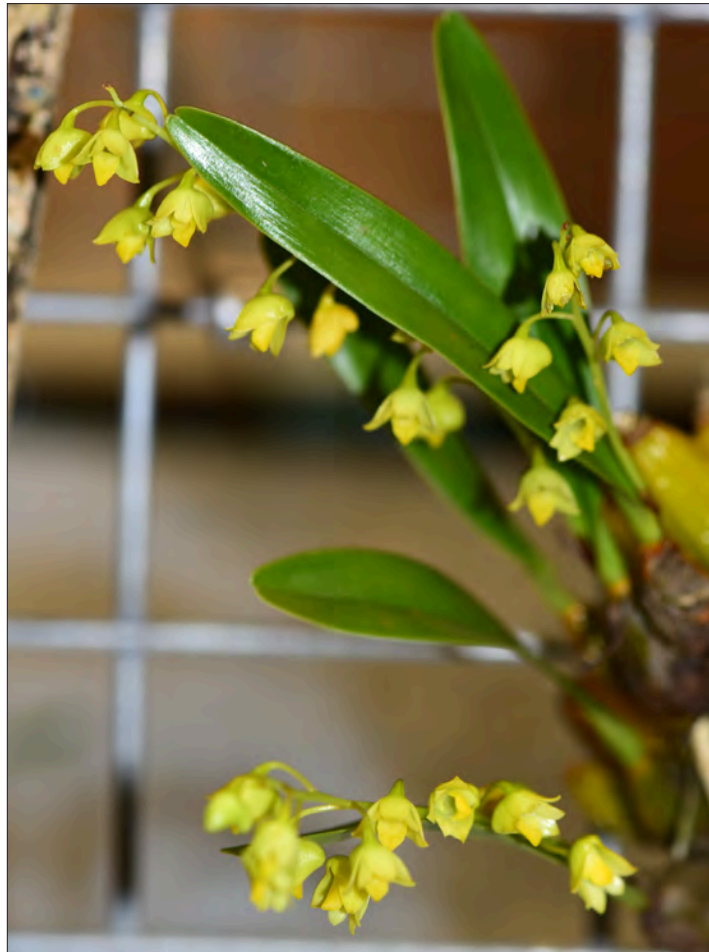
Dendrobium monophyllum