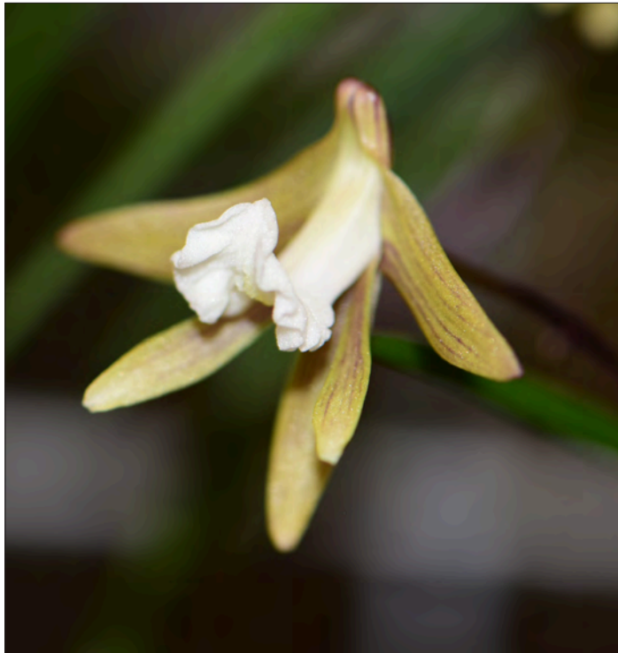
Dockrillia striolata 'Ruffles'