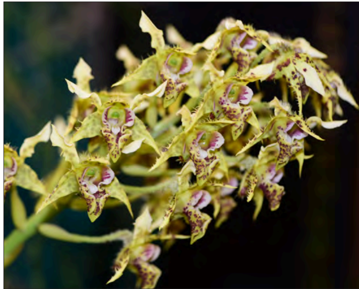
Dendrobium polysema Li Shan