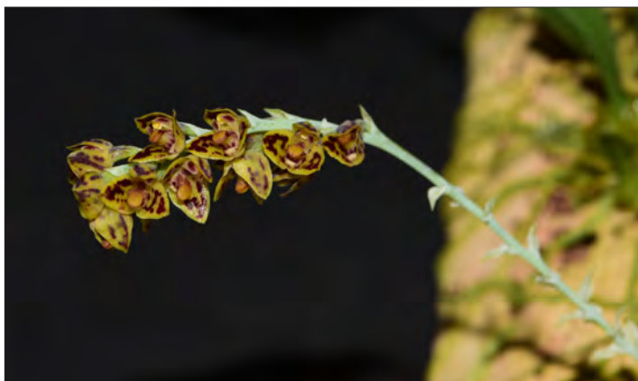
Bulbophyllum bracteatum