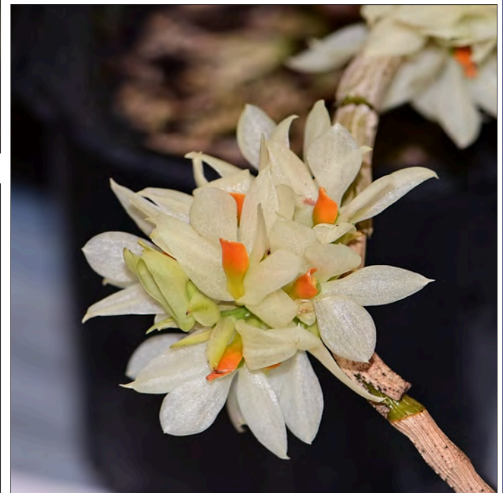
Dendrobium bracteatum Cary Polis