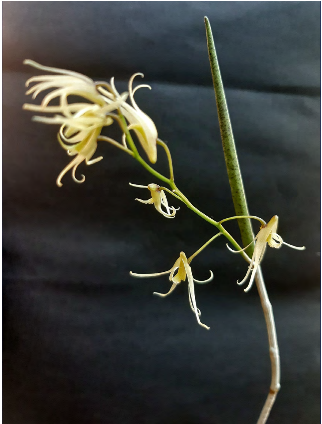
Dockrillia racemosa