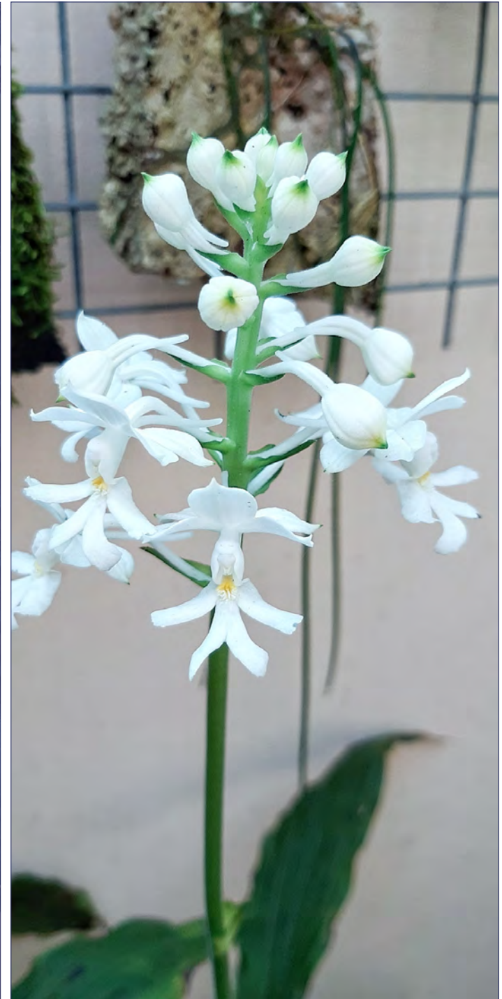
Calanthe triplicata - Trish Peterson