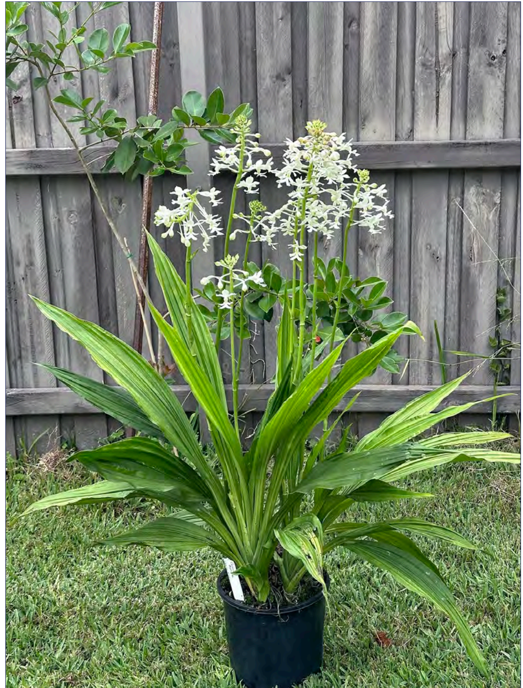
Calanthe triplicata L & B Dobson