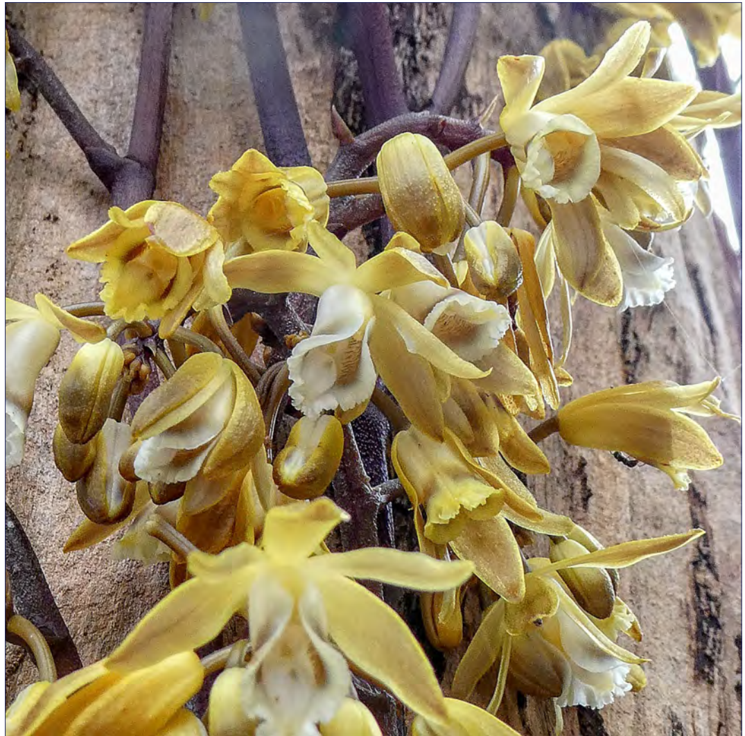
Erythrorchis cassythoides - Balls Head 2021 Trish Peterson

Erythrorchis cassythoides , commonly known as the black bootlace orchid. It has long, dark brown to blackish stems and groups of up to thirty yellowish to greenish, sweetly scented flowers and is endemic to eastern Australia.