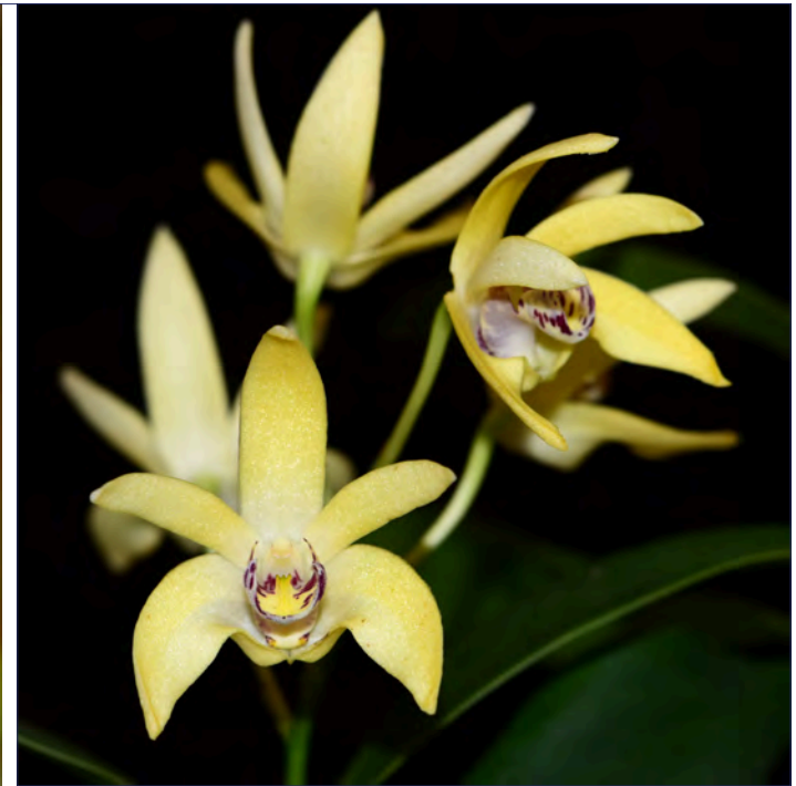
Dendrobium Tweetie David Hemmings