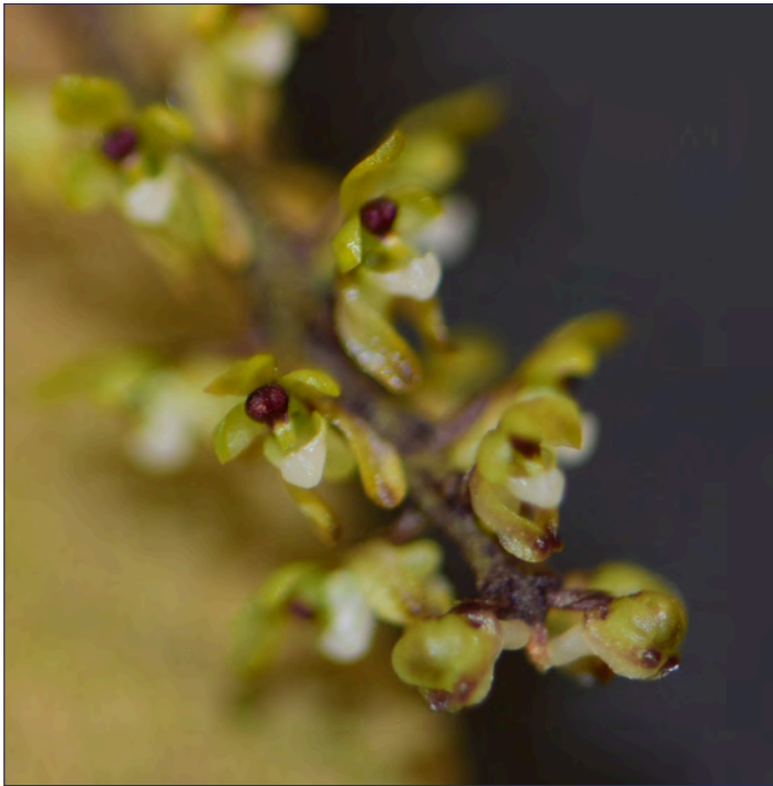
Saccolabiopsis armitii