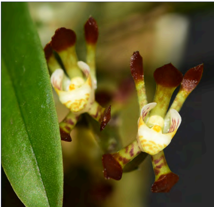
Sarcochilus dilatatus