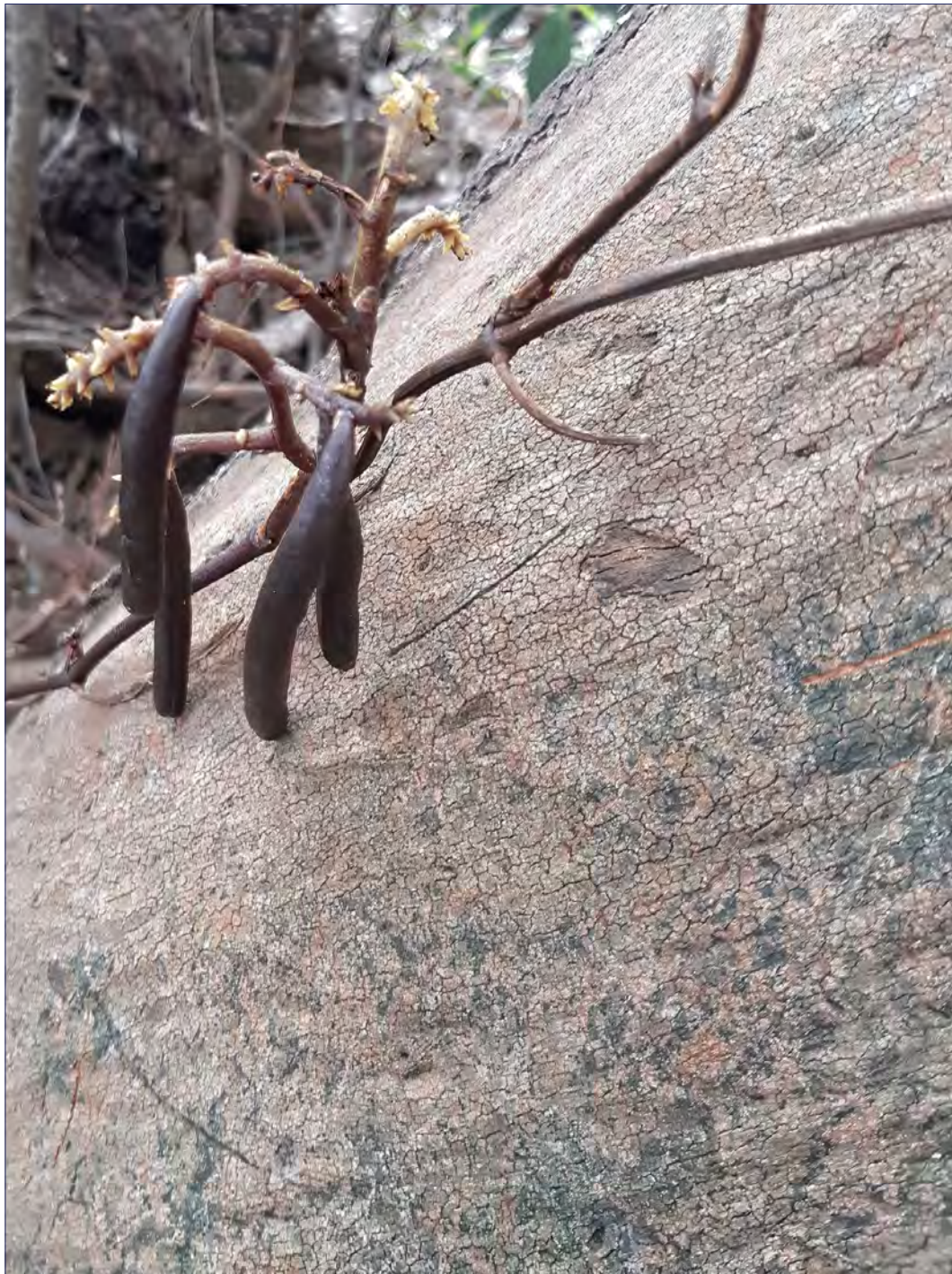
Erythrorchis cassythoides - seed pods, Balls Head 2024 Trish Peterson