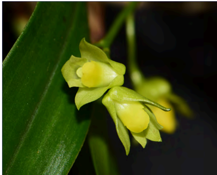
Dendrobium monophyllum Ros Mathews