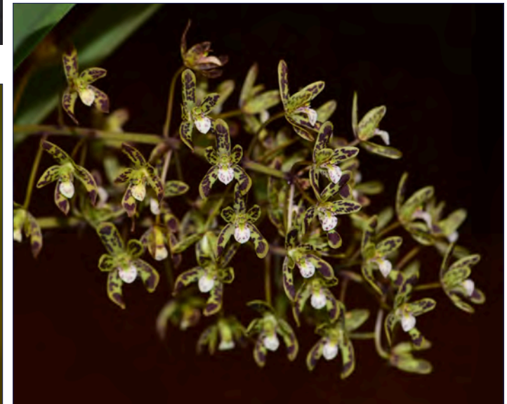
Cymbidium canaliculatum L & B Dobson