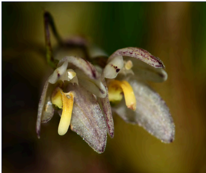
Bulbophyllum newportii