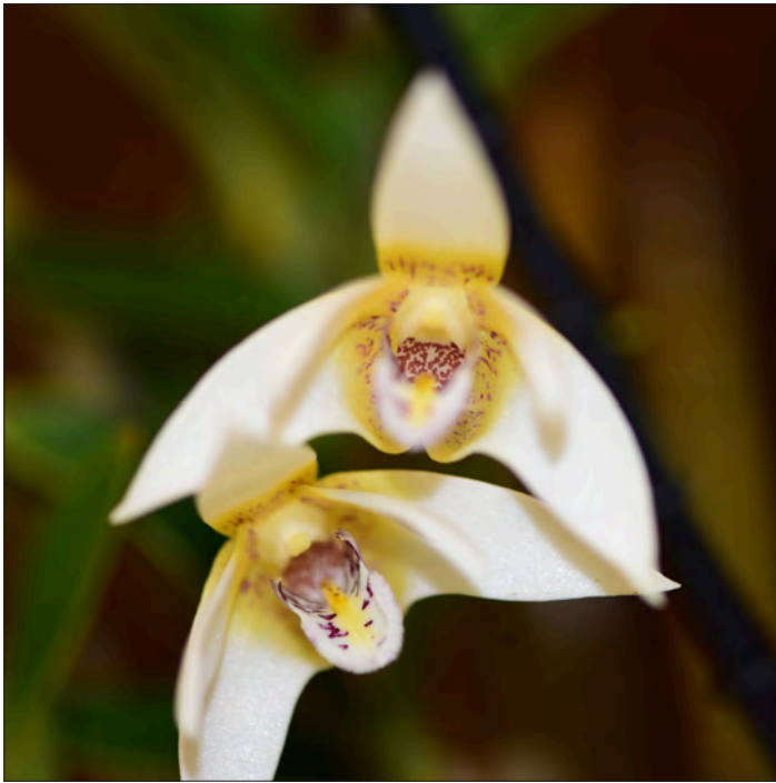
Dendrobium finiganense L & B Dobson