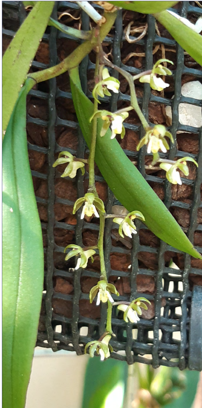
Plectorhizza tridentata - Green Form - Trish Peterson