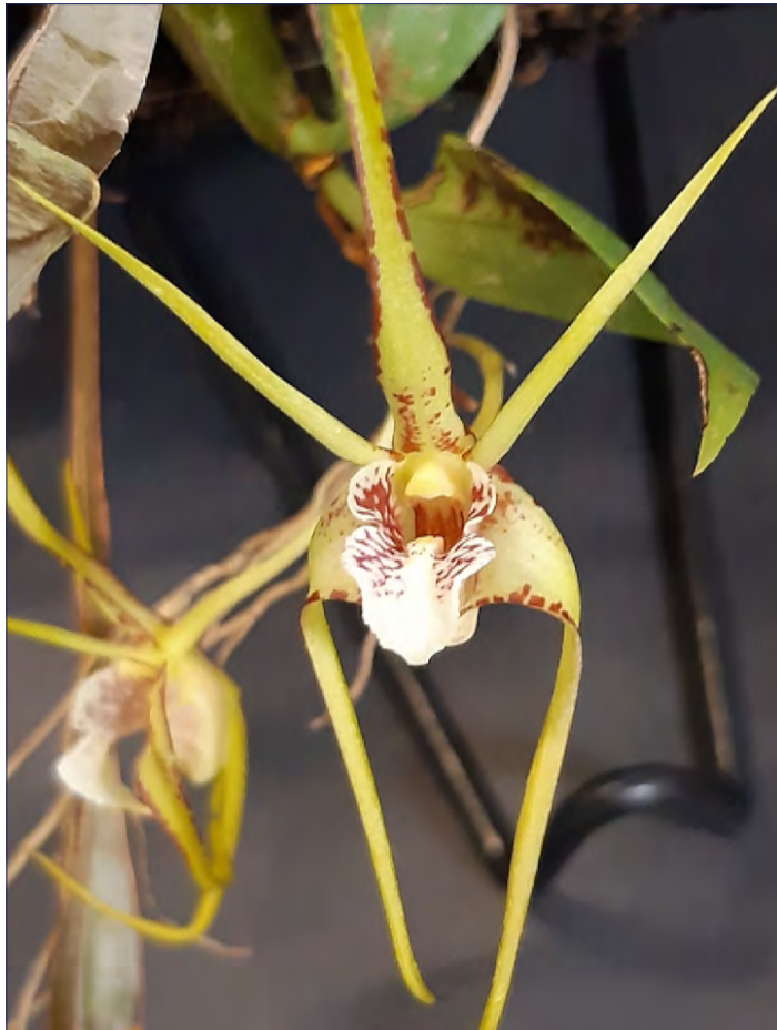
Dendrobium tetragonum - Conway Ranges - Trish Peterson