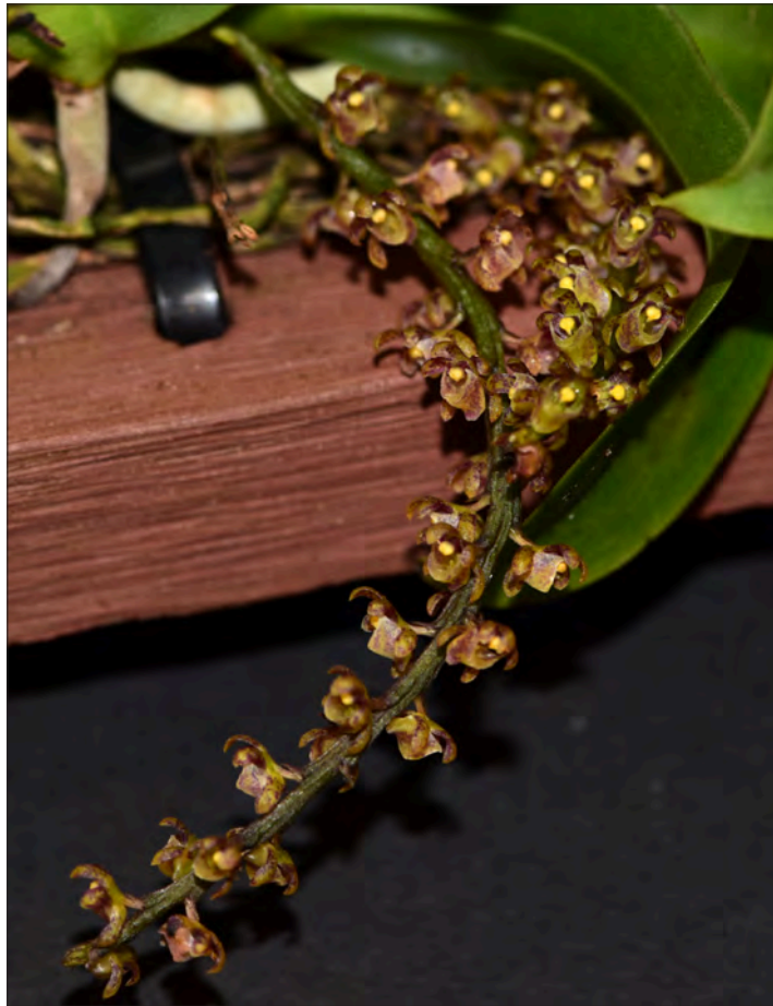
Peristeranthus hillii