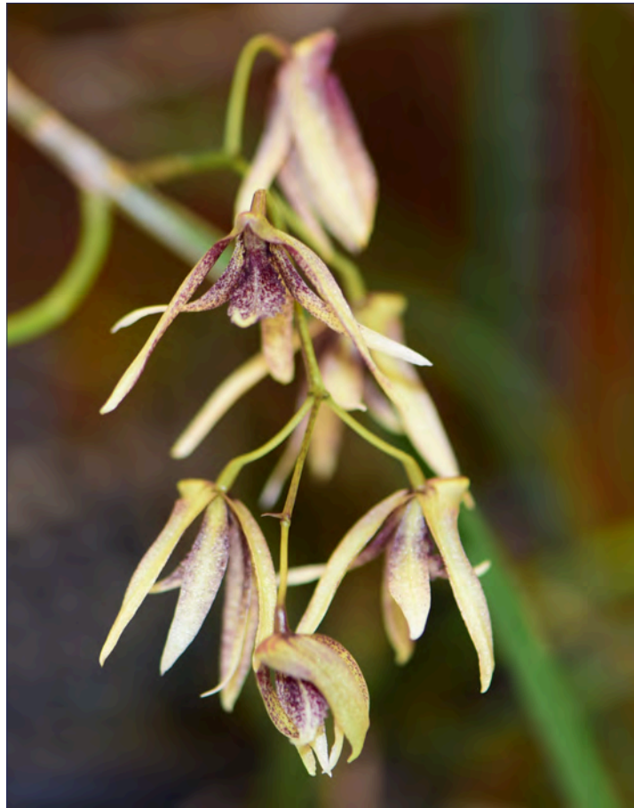
Doc Sultana x Tweetie x calamiformis Ros Mathews