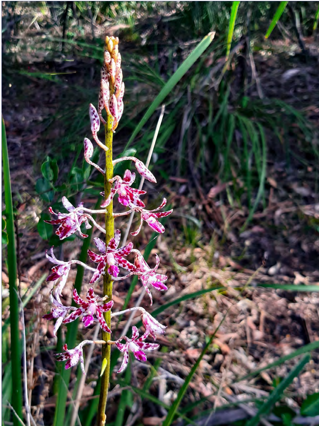
Dipodium variegatum - Berry Island Trish Peterson