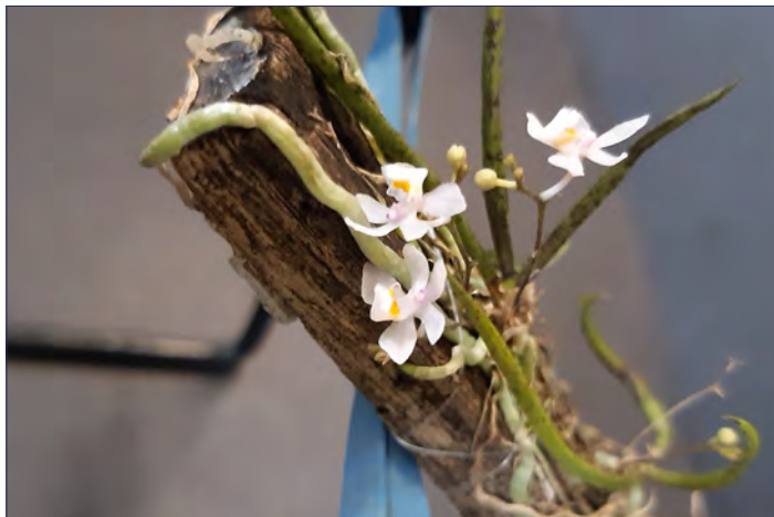
Sarcochilus hillii - Trish Peterson