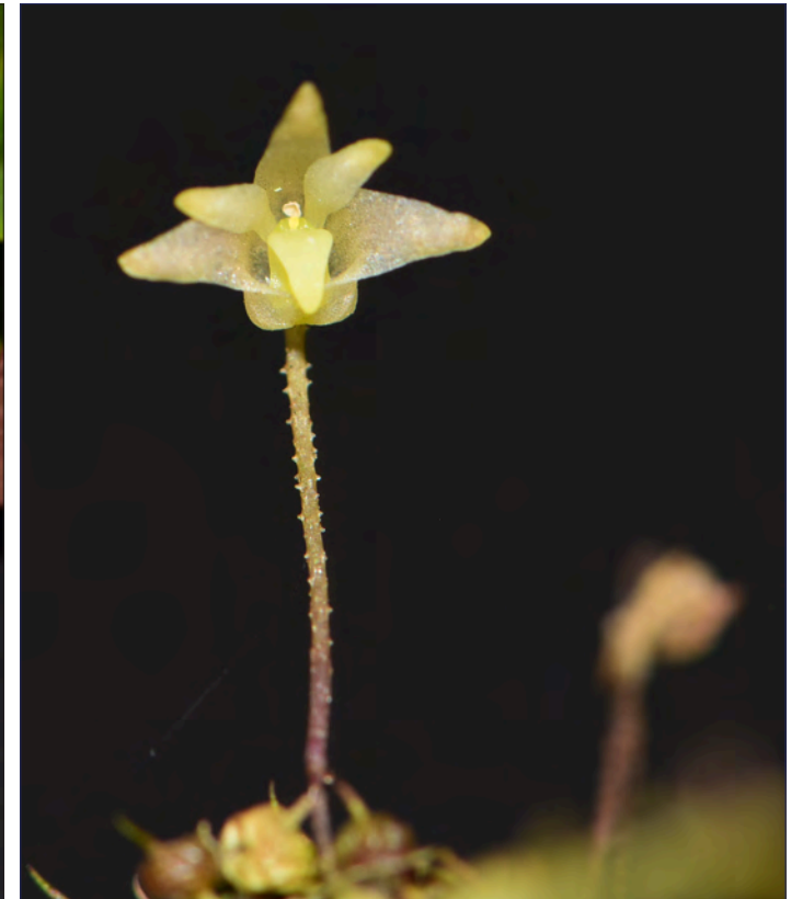
Bulbophyllum globuliforme