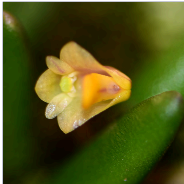
Dendrobium prenticei