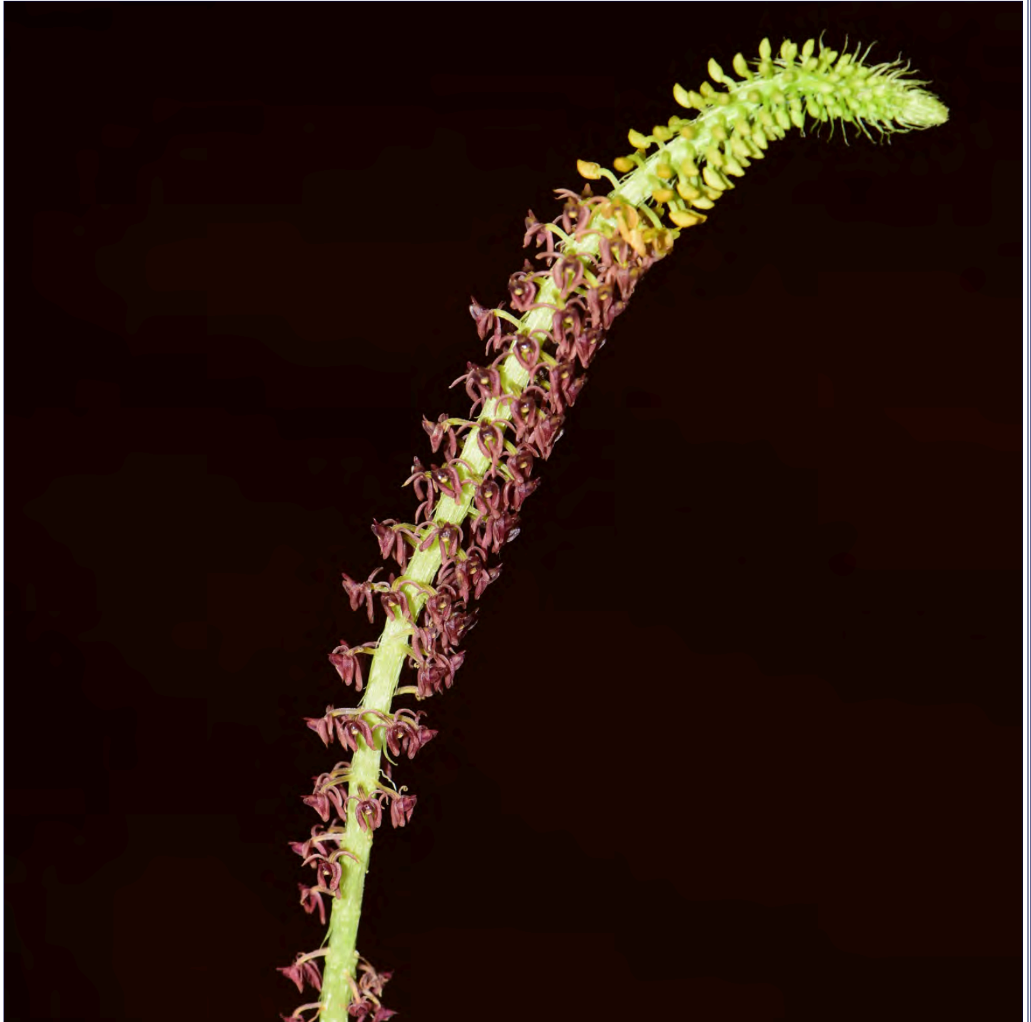
Malaxis latifolia