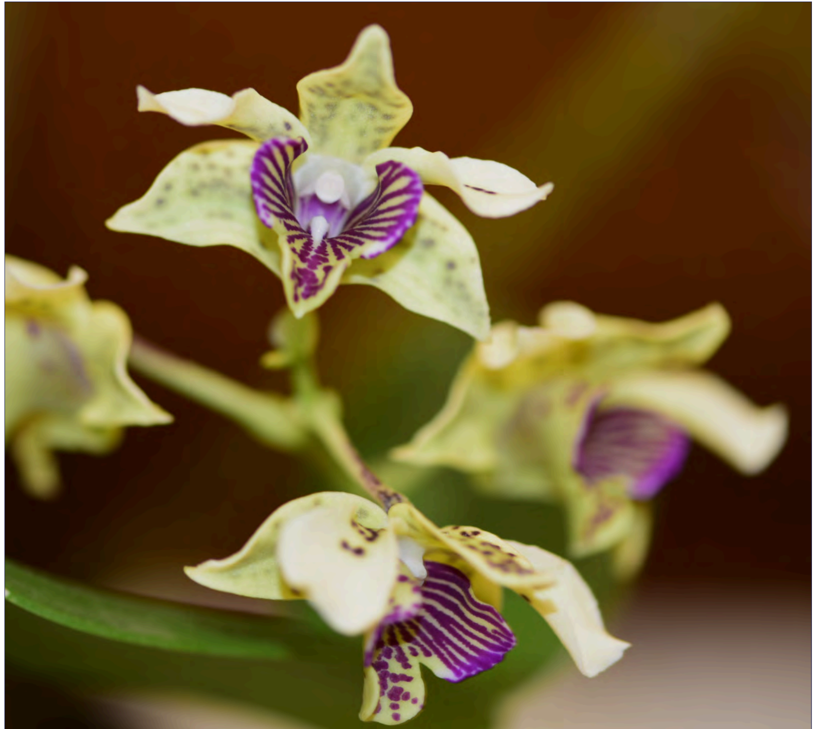
Dendrobium normanbyense x Microchip Li Shan